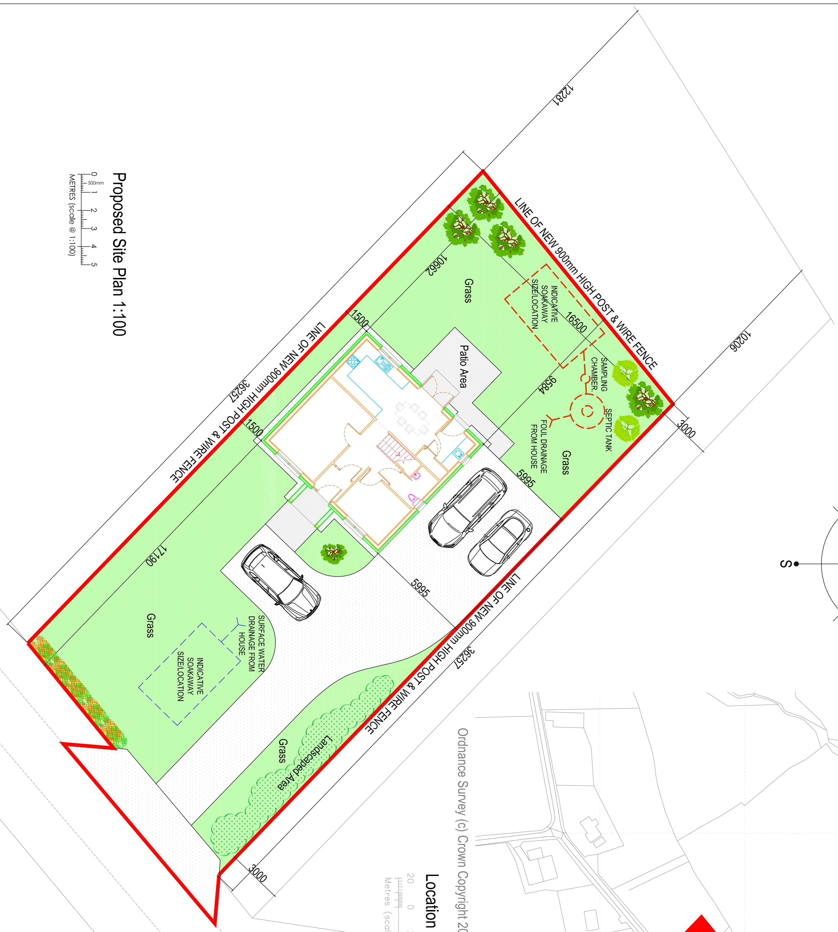
Proposed Site Plan 1:100